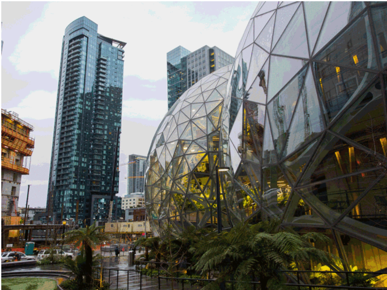
The Amazon.com Inc. Spheres, right, during opening day ceremonies at the company's campus in Seattle on Jan. 29. Unlike other U.S. tech centres, Seattle has kept up with the demands of a growing work population by building new housing at a higher rate than other tech hubs such as San Francisco.

Those unpleasant consequences are not necessarily inevitable, but experts say avoiding them would take a combination of careful planning and quick action on the part of the city.